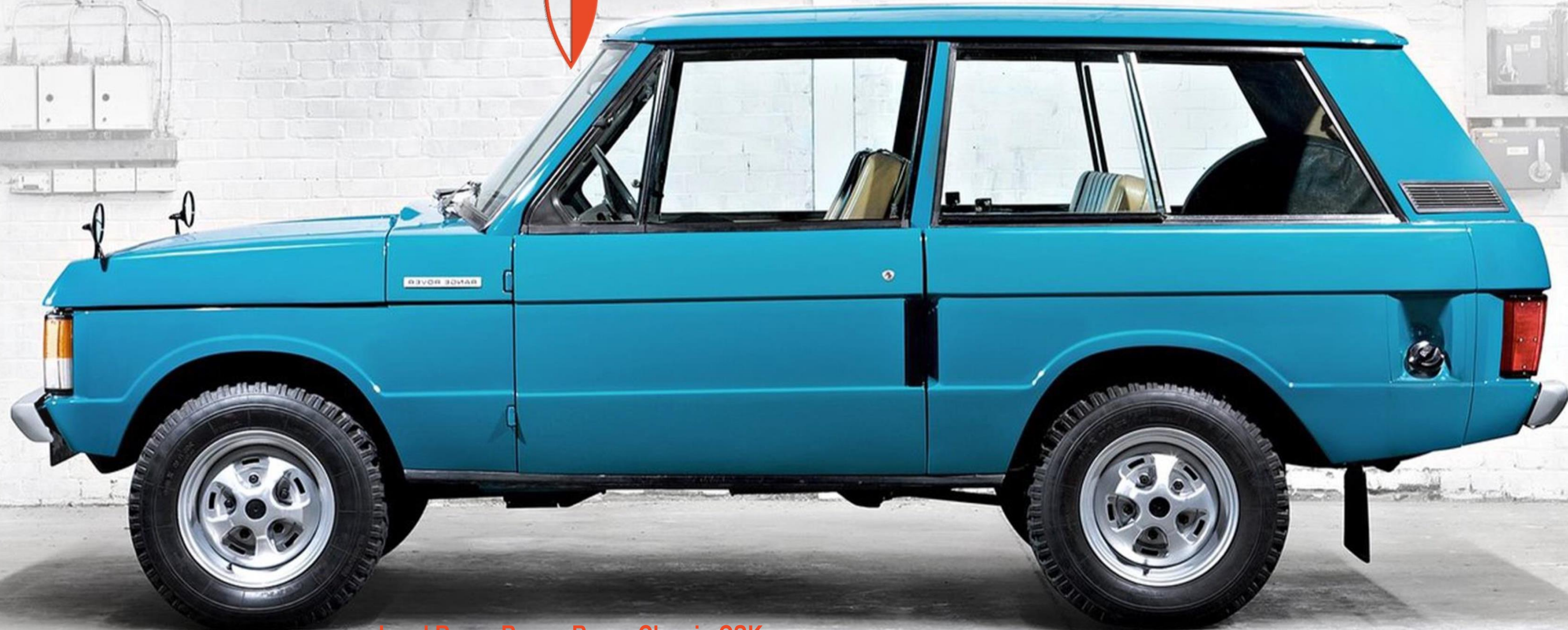
Land Rover Range Rover Classic CSK